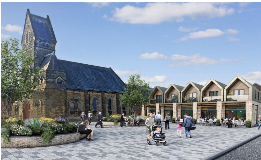
Figure 3: Leyland United Reform Church Place (CGI)