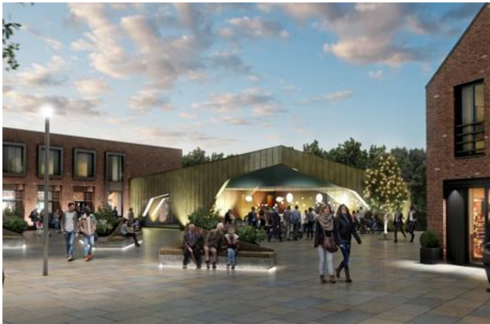
Figure 2: Market Place (CGI)